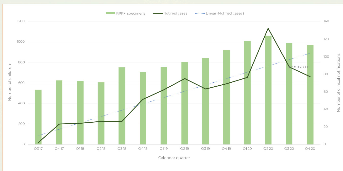
Figure 1: Trends in CS clinical notifications and RPR positive specimens by quarter 1 July 2017 – 31 December 2020

In the most recent quarter (October – December 2020), the Centre received 77 clinical notifications from 23 facilities in 17 districts and 968 RPR positive results from infants < 2 years. This was compared to 88 clinical notifications from 24 facilities in 15 districts and 986 RPR positive results among infants < 2 years in the previous quarter.